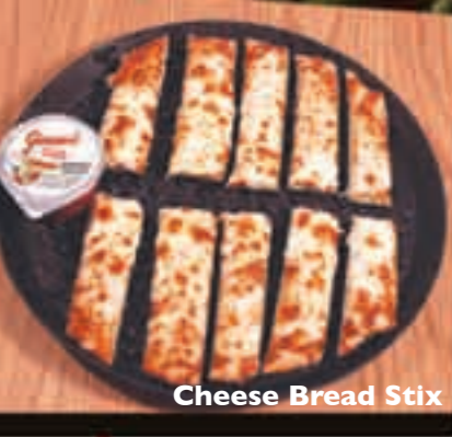
Cheese Bread Stix