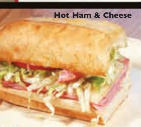
Hot Ham & Cheese

Your choice of sandwich with your favorite chips and a 20-oz. drink of your choice 8.89