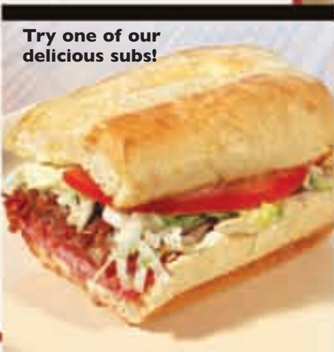
Try one of our delicious subs!

Mushroom & Cheese Sub Our sub roll piled with sautéed mushrooms and lots of melted cheese. Served with garlic, lettuce, tomato, onion and mayo 6.59