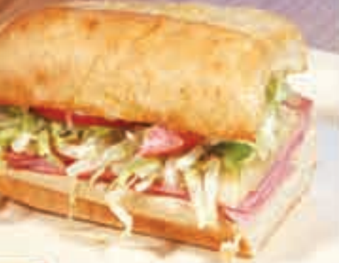
Hot Ham & Cheese

All sandwiches include lettuce, tomato, mayo and onion