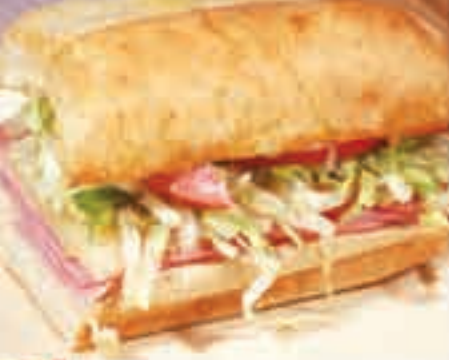
Hot Ham & Cheese

All of our sandwiches are served on a golden brown bun