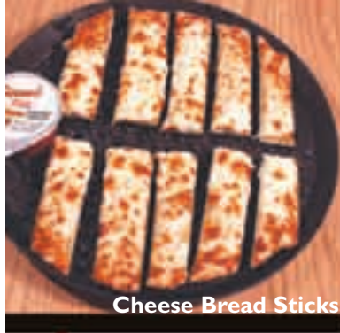
Cheese Bread Sticks