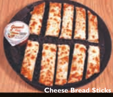
Cheese Bread Sticks