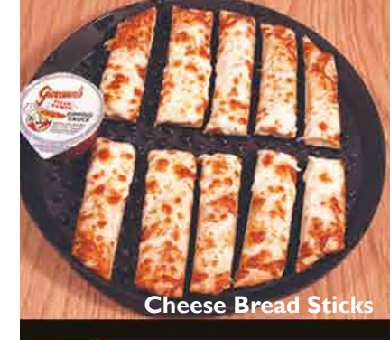
Cheese Bread Sticks