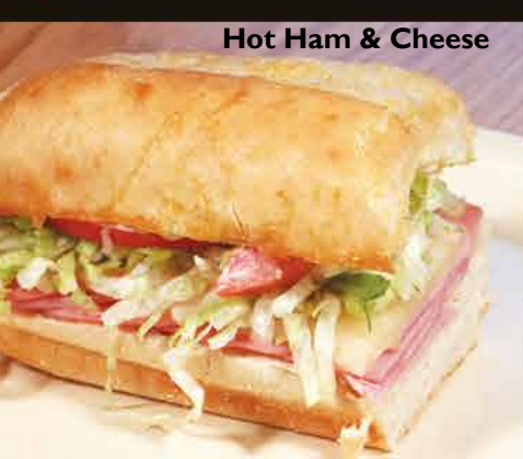
Hot Ham & Cheese

MAKE IT A PLATTER 2.49 extra Add French fries and soft drink to your sandwich