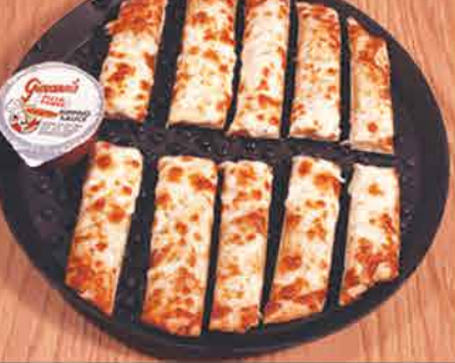
Cheese Bread Sticks