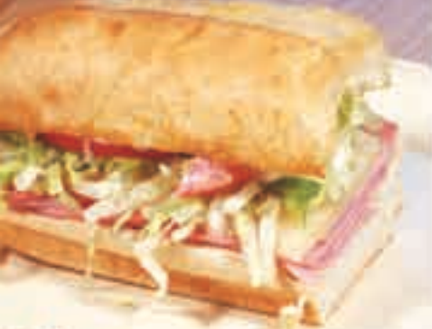
Hot Ham & Cheese

French Fries & Drink Platter - 2.59 extra