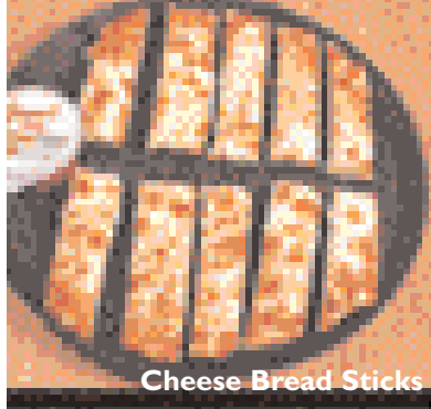
Cheese Bread Sticks