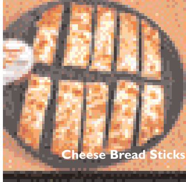
Cheese Bread Sticks