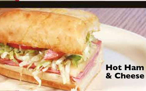
Hot Ham & Cheese

Make it a Platter, Your choice of any sandwich, plus golden French fries and soft drink 7.55 (dine in only)