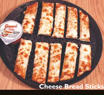
Cheese Bread Sticks