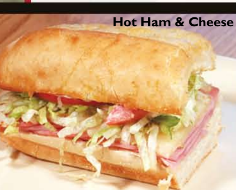
Hot Ham & Cheese

All sandwiches are made on a golden brown bun, baked to perfection and topped with "the works" lettuce, onion, tomato and mayo